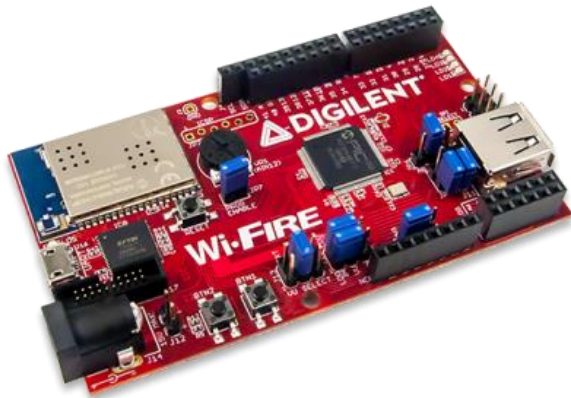
The Wi-FIRE board.