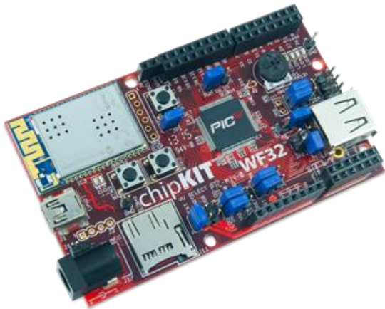
The WF32 board.

The WF32 is based on the popular Arduino™ open-source hardware prototyping platform and adds the performance of the Microchip PIC32 microcontroller. The WF32 is the first board from Digiilent to have a WiFi MRF24 and SD card on the board both with dedicated signals. The WF32 board takes advantage of the powerful PIC32MX695F512L microcontroller. This microcontroller features a 32-bit MIPS processor core running at 80Mhz, 512K of flash program memory, and 128K of SRAM data memory.