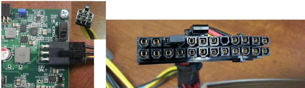
Figure1. Left: NetFPGA-1G can be powered by plugging the 6-pin PCIe power connector in J17; Right: Pin 16 and 17 are shorted using a jumper to power on a standard ATX power supply when used standalone.

The NetFPGA-1G can be powered using the 6-pin PCIe power supply connector (Fig. 1) of any standard ATX power supply. When installed on a PC motherboard, you can directly plug the 6-pin PCIe power supply connector of your PC power supply into J17. When used standalone (without a motherboard), you need to short pins 15 and 16 (pulling down PS_ON signal) of the main 20-pin connector of the standard ATX power supply to power-on the ATX unit (Fig.1).