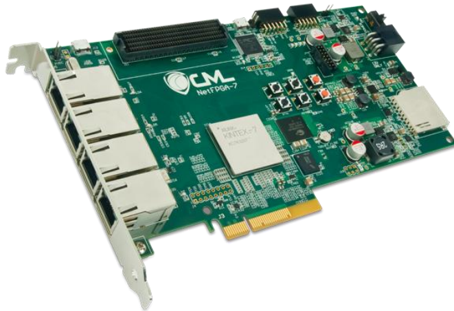
The NetFPGA-1G-CML board.

The NetFPGA-1G-CML is a versatile, low-cost network hardware development platform featuring a Xilinx® Kintex®-7 XC7K325T FPGA and includes four Ethernet interfaces capable of negotiating up to 1 GB/s connections. 512 MB of 800 MHz DDR3 can support high-throughput packet buffering while 4.5 MB of QDRII+ can maintain low-latency access to high demand data, like routing tables. Rapid boot configuration is supported by a 128 MB BPI Flash, which is also available for non-volatile storage applications. The standard PCIe form factor supports high speed x4 Gen 2 interfacing. The FMC carrier connector provides a convenient expansion interface for extending card functionality via Select I/O and GTX serial interfaces. The FMC connector can support SATA-II data rates for network storage applications. The FMC connector can also be used to extend functionality via a wide variety of other cards designed for communication, measurement, and control.