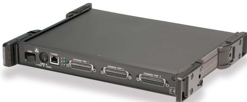
The WBK25 includes one 10/100BaseT Ethernet port and three high-speed parallel ports

If the WBK25 is attached to a shared Ethernet network, then data transfer rates will be dependent on the other network traffic at the time. It is not possible to guarantee maximum data transfer rates in this mode. However, the WaveBook offers internal memory options (WBK30 series) for applications such as this, so that the acquired data can be locally stored in the event that the shared network traffic prohibits the WaveBook from transferring data at the same rate at which it was acquired.