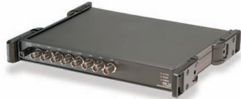
The WBK10A adds eight differential analog inputs