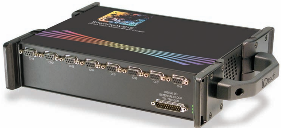
The Ethernet-based StrainBook/616 provides from 8 to 64 channels of automated bridge measurements

StrainBook/616 is a compact and portable strain gage measurement system that connects to your PC's Ethernet port. Eight channels of strain measurement are built into the StrainBook, and up to 64 channels can be measured with one StrainBook using 8-channel WBK16 options. For applications with more than 64 channels, multiple StrainBook systems can be combined and synchronized for a virtually limitless number of strain measurement channels. The StrainBook is also capable of measuring voltage, temperature, vibration, and sound using other WBK signal conditioning options.