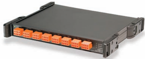
The WBK15 provides up to 8 isolated analog input channels