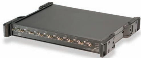
The WBK16 provides eight channels of strain gage input