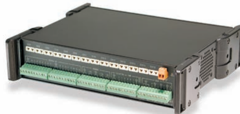
The WBK41 provides thermocouple and counter inputs (not supported in WaveView)