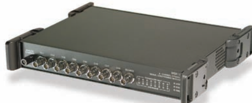
The WBK18 provides a full set of features for making dynamic signal measurements