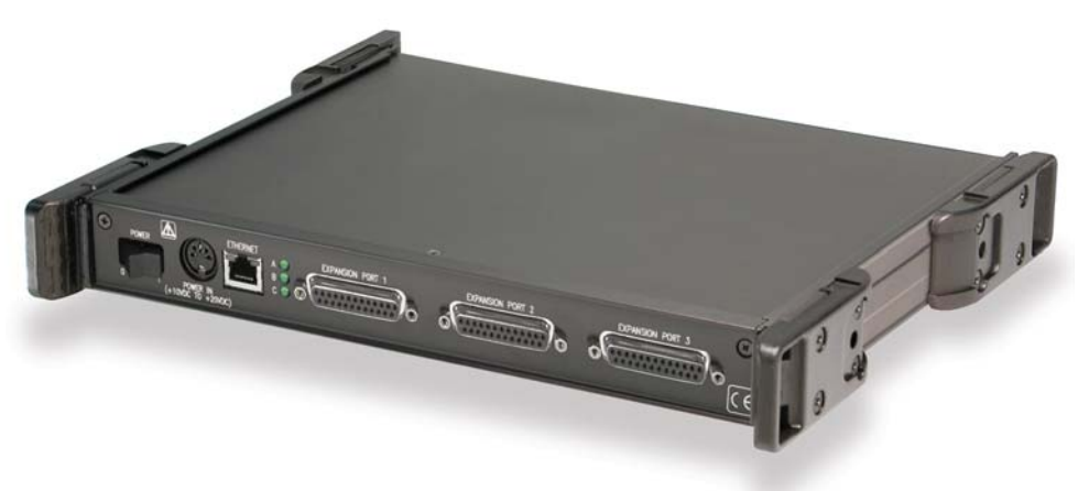
The WBK25 includes one 10/100BaseT Ethernet port and three high-speed parallel ports

If the WBK25 is attached to a shared Ethernet network, then data transfer rates will be dependent on the other network traffic at the time. It is not possible to guarantee maximum data transfer rates in this mode. However, the WaveBook offers internal memory options (WBK30 series) for applications such as this, so that the acquired data can be locally stored in the event that the shared network traffic prohibits the WaveBook from transferring data at the same rate at which it was acquired.