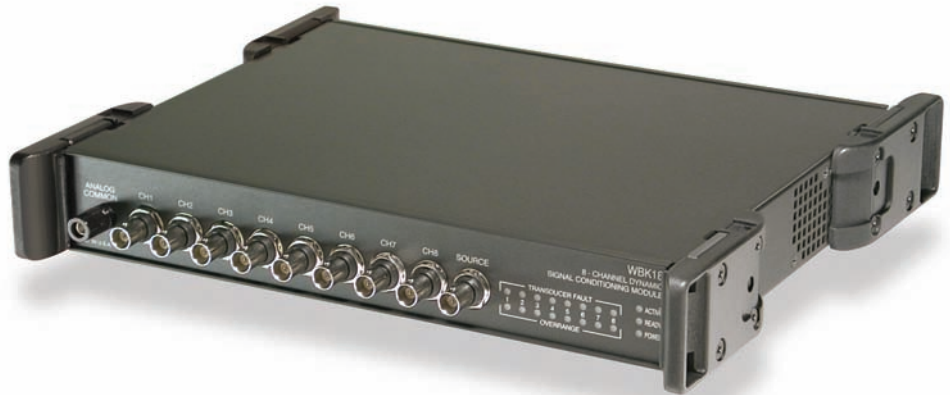
The WBK18 provides a full set of features for making dynamic signal measurements

The WBK18 provides 8 channels of dynamic signal input for WaveBook or ZonicBook systems. The WBK18 provides all of the signal conditioning and biasing required for the system to accept piezoelectric accelerometers, piezoelectric pressure sensors, piezoelectric microphones, proximity sensors, or any other dynamic input source. All channels on the WBK18, and on other WBK18 modules within the same system, are sampled simultaneously to insure phase matching between channels. Each WBK18 channel features a software programmable 8-pole low-pass filter to remove undesired frequencies and alias components. Data integrity is additionally insured through overrange and IEPE fault detection mechanisms.