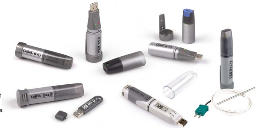
USB-500 Series data loggers offer low-cost, stand-alone data collection for temperature, humidity, voltage, current, or event/state change