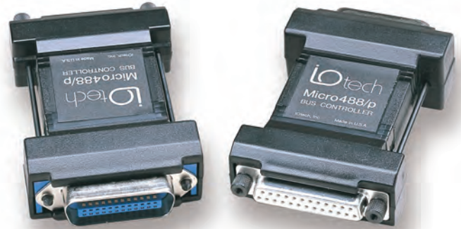
The low-cost Micro488/p enables IEEE 488 control from any computer equipped with a serial port