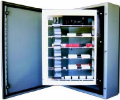
The CIE-CHASSIS-06 shown mounted in the (optional) CIE-NEMA4X enclosure

The CIE-CHASSIS-06 mounting chassis provides a compact, rugged mounting system for up to 6 MetraBus I/O boards. The CIE-CHASSIS-06 may be mounted free standing, attached to a wall or any flat surface, may be installed in NEMA enclosures or in standard 24 inch racks. A louvered top plate ensures maximum convective cooling while ac fan cooling is available as an option. The top and bottom plates may be removed, allowing CIE-CHASSIS-06 units to be stacked without affecting cooling air flow.