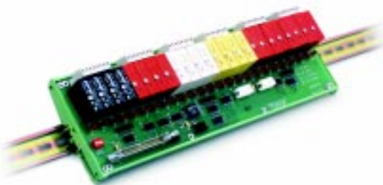
MSSR-24 board shown mounted in DIN-16X4.8 DIN Rail Kit