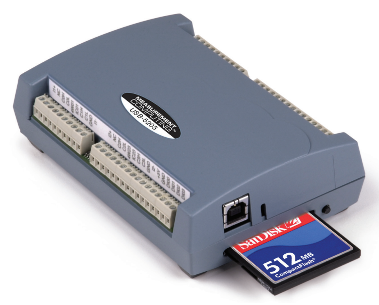
USB-5200 Series data loggers provide eight temperature inputs. Measurements are stored onto a CompactFlash card and downloaded for conversion to text or csv.