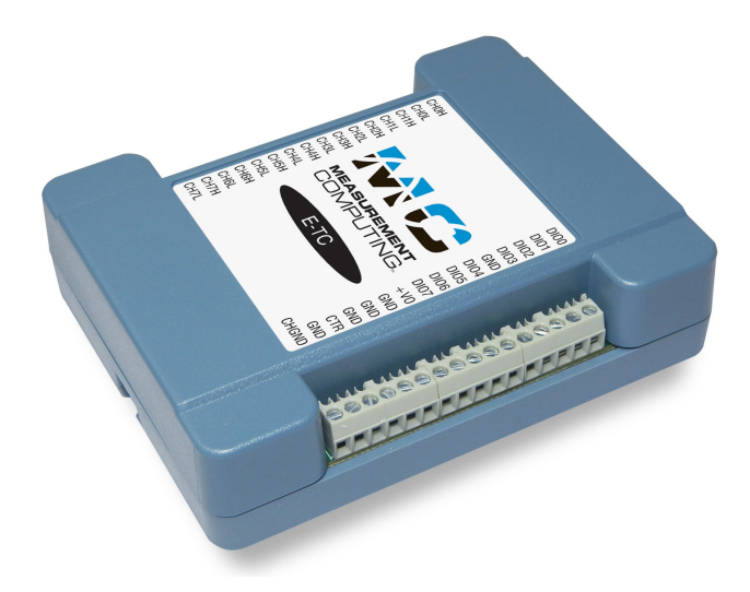
The E-TC devices offers eight thermocouple channels and eight DIO channels which are bit-configurable for input or output. Output bits can be further configured as thermocouple alarms.