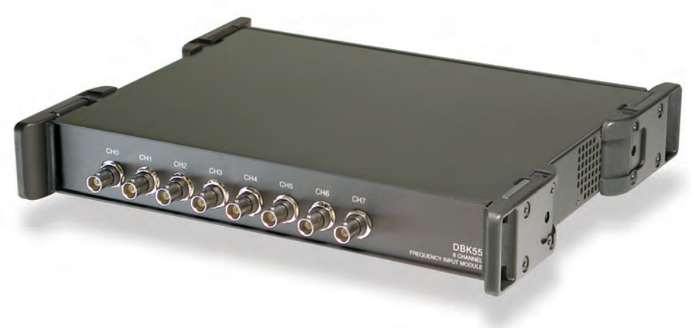
The DBK55 provides eight frequency inputs

The DBK55 frequency-input module provides IOtech's data acquisition systems with eight channels of frequency-measurement capability. The module measures the input signal's frequency and converts the frequency to a voltage, which can then be measured by the data acquisition system. The DBK55's output is read by the data acquisition system along with any other analog channels included in the analog scan group, allowing easy correlation of readings from the DBK55 with other test parameters. The DBK55 is particularly useful for making RPM measurements in applications such as automotive testing or the monitoring of flow meters. As many as 32 DBK55s can be connected to one data acquisition system for a total of up to 256 channels. The DBK55 accepts low- and high-level analog signals, as well as digital signals.