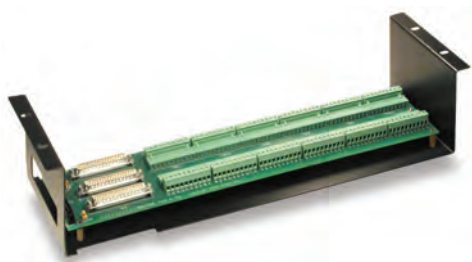
Rack3 rack-mount kit for the DBK206