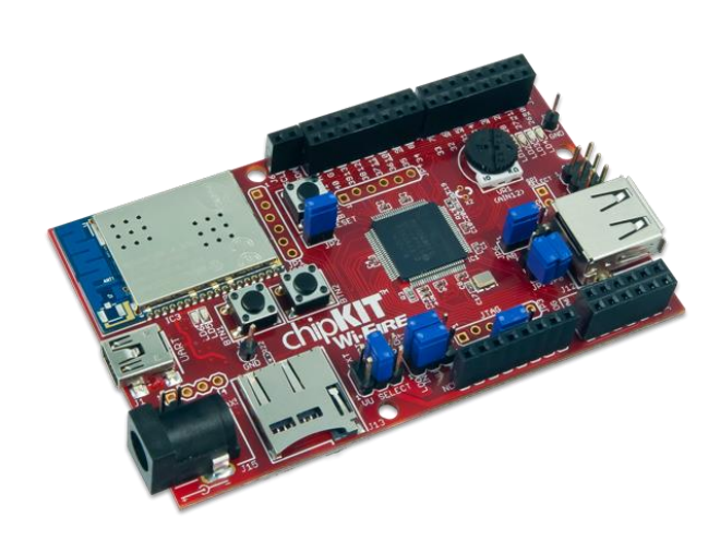
The chipKIT Wi-FIRE board.