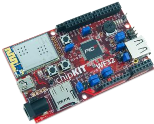
The chipKIT WF32 board.

The chipKIT WF32 is based on the popular Arduino™ open-source hardware prototyping platform and adds the performance of the Microchip PIC32 microcontroller. The WF32 is the first board from Digiilent to have a WiFi MRF24 and SD card on the board both with dedicated signals. The WF32 board takes advantage of the powerful PIC32MX695F512L microcontroller. This microcontroller features a 32-bit MIPS processor core running at 80Mhz, 512K of flash program memory, and 128K of SRAM data memory.